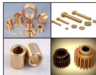
DEFENSE AND OTHER ENGINEERING INDUSTRIES